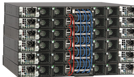
Figure 4: Up to 12 Ruckus ICX 7750 Switches can be stacked using up to 12 standard full-duplex 40 Gbps QSFP+ ports per switch, providing up to 5.76 Tbps of aggregated stacking bandwidth.